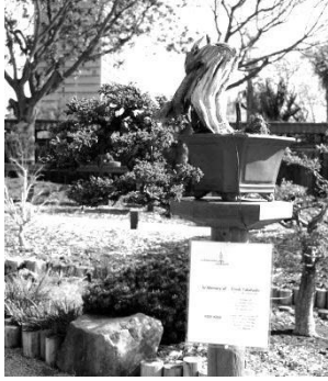
Takahashi tree display