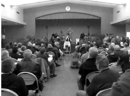
Inside the Mammoth Fundraiser on Saturday afternoon, the auction was packed with visitors.